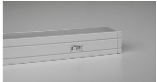
Standard three selectable CCT 3000K, 3500K, 4000K