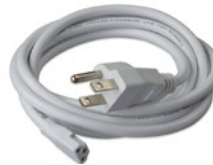
Plug-In Power Feed